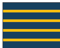
Pattern A (2-color)