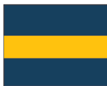
Pattern 7 (2-color)