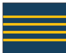
Pattern 3 (2-color)