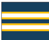
Pattern 2 (3-color)