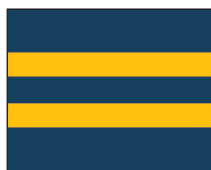
Pattern 4 (2-color)