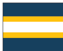
Pattern T (3-color)

3/4" braid trim is available on Sailor Collars and Zip Divided Hood in patterns S and 7 only.