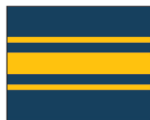
Pattern 5 (2-color)