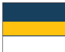
Pattern 9 (3-color)